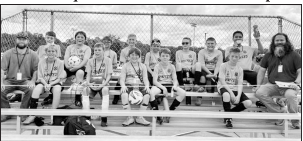
Union County Earthquakes 12U soccer team

County Earthquakes boys' 12U soccer team participated in the Rec Roundup tournament in